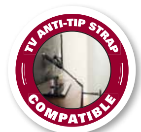
Anti-tip strap compatible