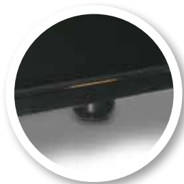
Distressed black finish