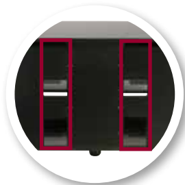
Removable back panels