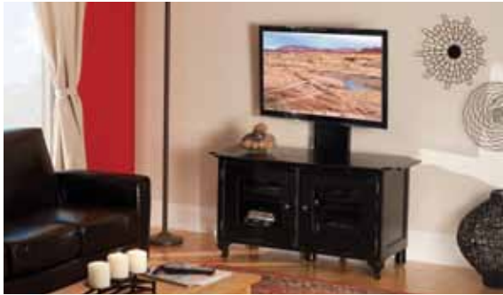
BFV348 shown with FMS

Introducing the BFV348 AV stand – the newest addition to the Basic Series furniture line. Offering a quick and easy tool-less assembly, this piece features a distressed black finish for a classic, lived-in appearance. A vented, adjustable shelf maximizes airflow to equipment while offering versatility to accommodate equipment of varying heights. Removable back panels ensure all AV components can be easily accessed at anytime.