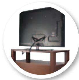
Reduces risk of tipping