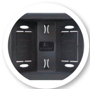
Cable routing holes and single-gang pass-throughs