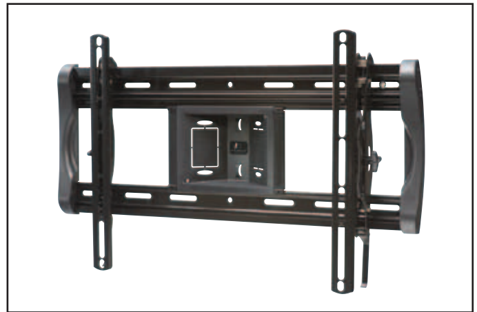
ELM803-B1 shown in use with VisionMount® model LT25

The Sanus Elements™ ELM803 in-wall low voltage box helps to position thin flat-panel TVs as flush with the wall as possible, offering 56 cubic inches of space to hold cables and create a clean cavity in the wall. Great for use behind mounts with or without ClickFit™ compatibility, the ELM803 features cable routing holes and single-gang low voltage pass-through inlet/outlet knockouts for the ultimate in convenience. Simply fit the in-wall box into an opening behind any wall-mounted TV to route cables and wires into the wall for a seamless appearance.