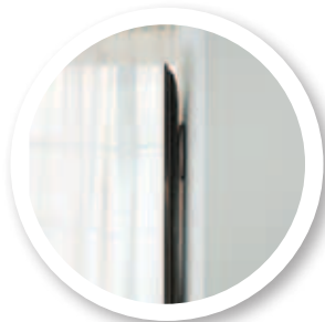
Use with ultra-low profile mounts