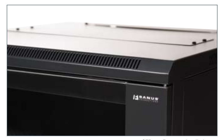
CFR127-B1 vent detail shown

New Sanus Foundations® Component 100 Series AV rack solutions come pre-assembled with shelves and blanking panels to simplify ordering, giving you the ultimate in quality and flexibility. These solid racks offer locking doors, removable side and back panels and Sanus' exclusive convection cooling system, which allows heated air to escape through the top of the rack while cool air is drawn in from the bottom, keeping AV components at the proper temperature. Add-on accessories are also available, allowing you to create a complete rack perfect for your unique installation.