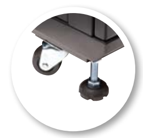
Swivel casters and adjustable feet