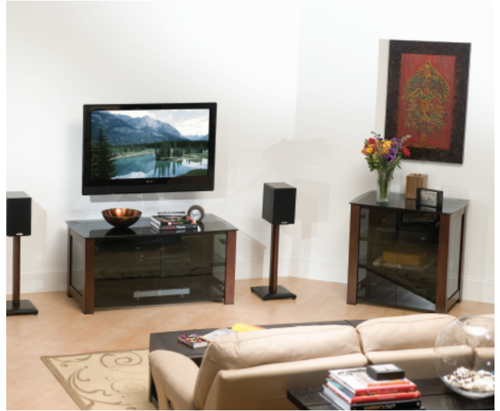
models DFV49 and DFAV30 shown

The new Designer Series lives up to its name: these elegant AV stands were created exclusively for Sanus by renowned industrial design firm Cramer Studio. Each piece features an innovative construction of rich, mocha-finished hardwood and smoked tempered glass. This unique design gives AV gear an enclosed look without blocking infrared remote controls. Sanus' convection cooling system maximizes performance by keeping AV gear cool even in enclosed cabinets. And because the Designer Series was created to handle large AV components, both pieces feature steel back panels that can be removed individually for additional depth, or to allow easy cabling and maintenance.