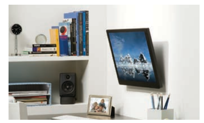
VST15-B1 in use

The new VST15 tilting mount features an innovative design that makes it incredibly easy to install and use. Its unique wall plate allows a TV to be mounted in one easy movement and locked to the wall with a safety latch for added security. Virtual Axis ^{\text{\tiny M}} tilting technology allows smooth, easy tilt motion to reduce glare and maximize picture quality with the touch of a finger. The VST15 features a slim, low-profile design that is VESA 200 x 100 and 100 x 100 compatible to fit most 13" - 26" TVs.