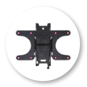
VESA-compatible TV bracket