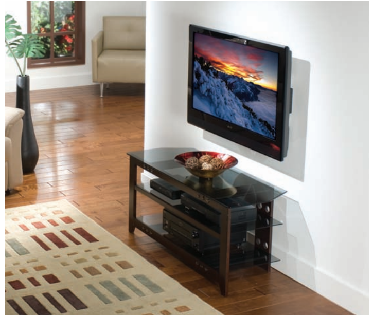
model LL22 shown

The new LL22 low-profile mount was designed to make installation a breeze. This sturdy, ultra-light mount is constructed of extruded aluminum and features an open wall plate design for easy cable management. Our exclusive ProSet™ height and leveling adjustments ensure TVs are always perfectly positioned after mounting. The innovative ClickStand™ feature holds the TV away from the wall for easy cable installation, then clicks securely back onto the wall plate. ClickFit™ system allows power conditioners and other small devices to be positioned directly behind the TV and easily clicked onto the mount, so they stay hidden yet easily accessible. And the low-profile LL22 sits nearly flush against the wall, maximizing the sleek, thin look of a flat-panel TV.