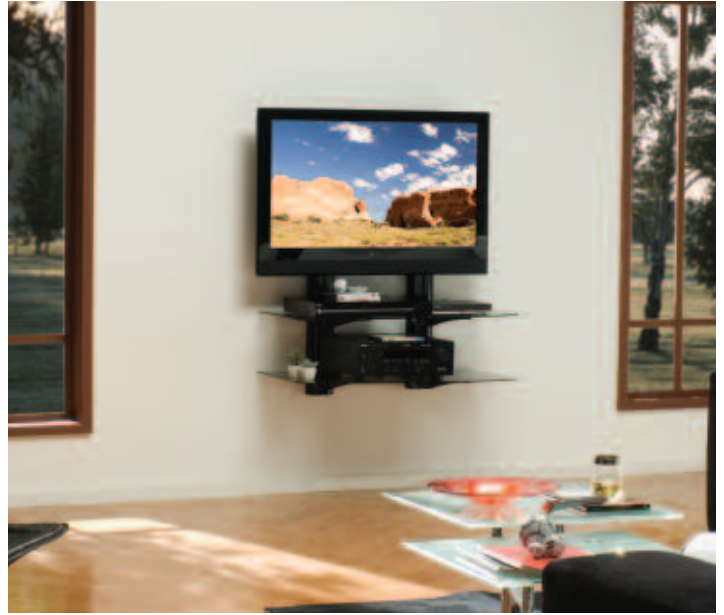
left: model VF2012-B1 shown; right: model VF2022-B1 shown