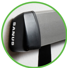
Stylish brushed metal exterior seamlessly blends with TV and décor