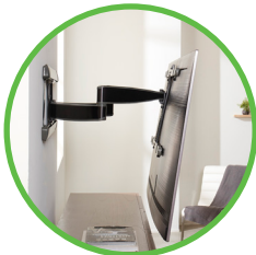
Steady Set™ holds TV in exact position – preventing drift and unwanted TV movement