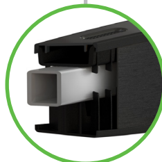
Precision-engineered, ultra-strong, solid steel frame provides maximum support