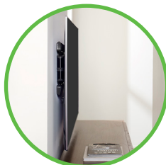
Slim full-motion mount sits just 2.15" from the wall in home position accentuating the sleek look of ultra-thin TVs