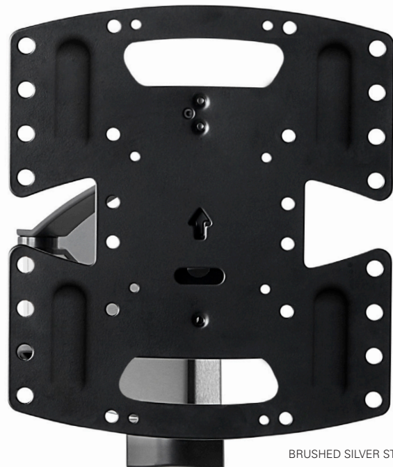
BRUSHED SILVER STAINLESS