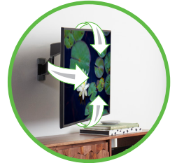
FluidMotion™ design provides effortless TV movement