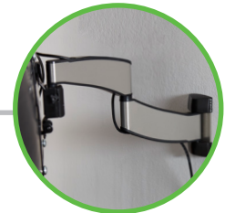
In-arm cable management creates a clean look