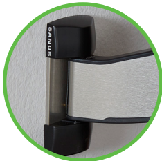
Stylish brushed metal exterior seamlessly blends with TV and décor