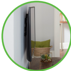
Slim full-motion mount sits just 1.8" from the wall in home position accentuating the sleek look of ultra-thin TVs