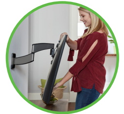
Virtual Axis™ provides fingertip tilt