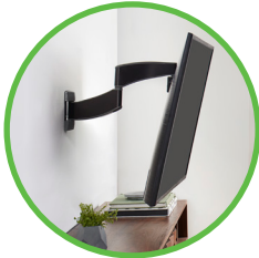
Steady Set™ holds TV in exact position – preventing drift and unwanted TV movement