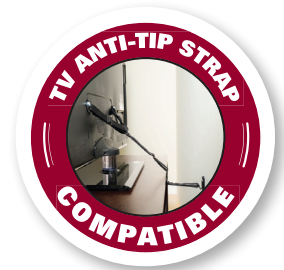
Anti-tip strap compatible