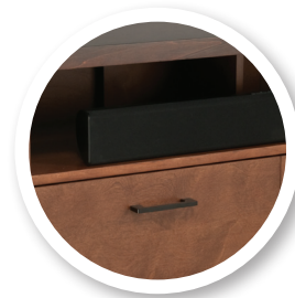
Large middle shelf