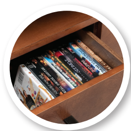
Media storage box