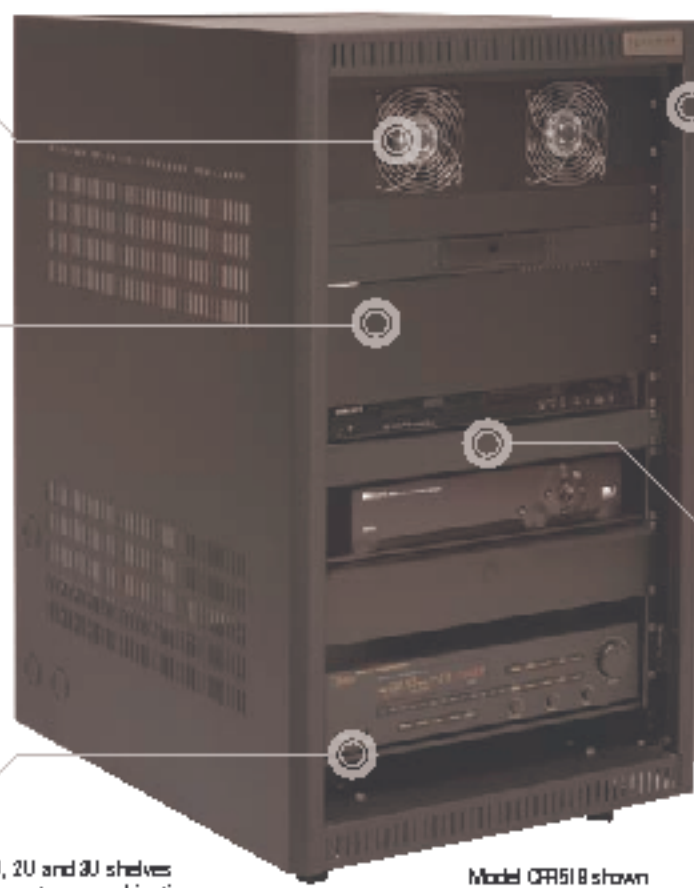
Model QFR518 shown

1U, 2U and 3U shelves support any combination of AV gear